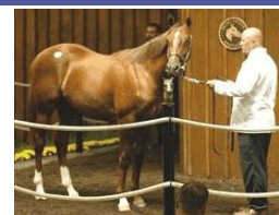
Hip 152 — $450,000

Storm Cat — Train Robbery, by Alydar 2004 Stud Fee: $35,000 live foal