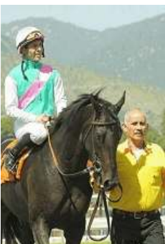
Heat Haze at Santa Anita