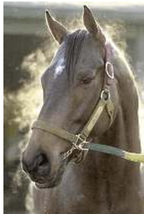
Kona Gold

The distinguished racing career of champion sprinter Kona Gold (Java Gold--Double Sunrise, by Slew o' Gold) has officially come to a close. The nine-year-old gelding, a winner of 10 graded-stakes races, ended his career with a fifth-place effort in Saturday's GII Bing Crosby