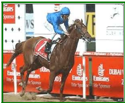
Moon Ballad wins 2003 Dubai World Cup

ALL HORSES IN TDN HEADLINE NEWS AND TDN AMERICAN EDITION ARE BRED IN NORTH AMERICA, UNLESS OTHERWISE INDICATED