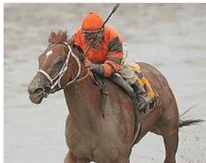
Willa On The Move

Never worse than second in five previous tries at six furlongs, Willa On The Move (Two Punch) kept that record intact with a rallying half-length victory over favored Shine Again (Wild Again) in the GIII Honorable Miss S. in the slop at Saratoga yesterday. Second in three graded events last season, including the GI Acorn S., the chestnut ended the year with a fifth-place finish against older fillies in the Nov. 29 GII Top Flight S. She had been out just once since, crossing the finish line a nose behind Redhead