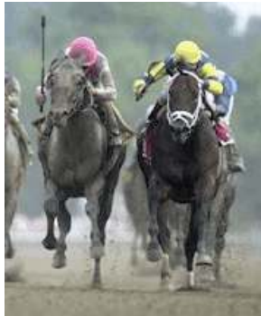
Strong Hope (inside)