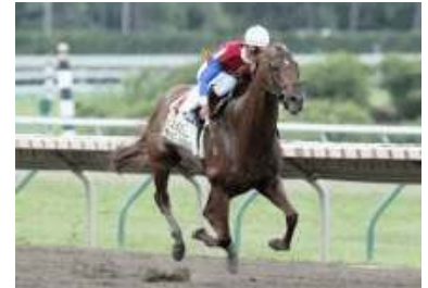
Peace Rules