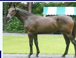
Click here to enlarge photo