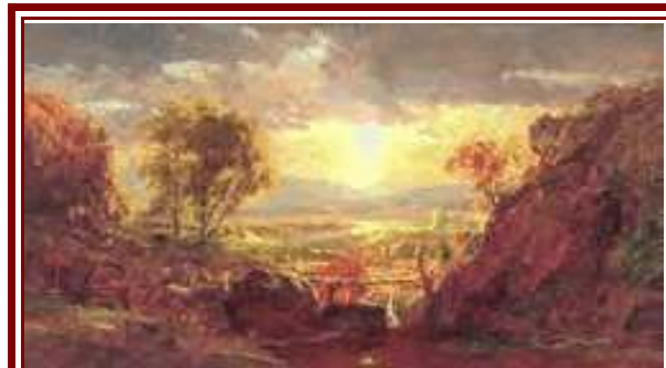
Jasper F. Cropsey (1823-1900)

© Copyright Thoroughbred Daily News. This newspaper may not be reproduced in any form or by any means, electronic or mechanical, without prior written permission of the copyright owner, MediaVista. Information as to the American races, race results and earnings was obtained from results charts published in Daily Racing Form and utilized here with the permission of the copyright owner, Daily Racing Form.