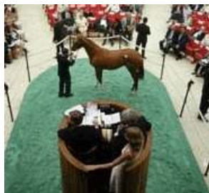
Hip 13

A filly by super sire Storm Cat out of champion Jewel Princess (Key to the Mint) fetched a final bid of $1.1 million to top last night's strong opening session of the Fasig-Tipton Saratoga Yearling Sales in Saratoga Springs, NY. The chestnut was consigned by Lane's End, agent, and Eugene Melnyk made the winning bid.