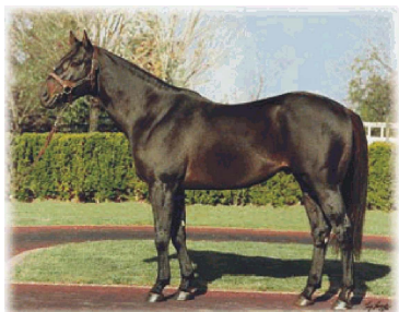
By Seattle Slew, out of Too Bald