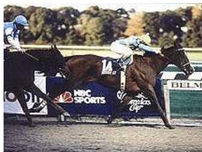
Unbridled winning the Classic

The popularity of Kentucky Derby and Breeders' Cup Classic hero Unbridled at the Saratoga Sale was unmistakable as the three offerings from his final crop of