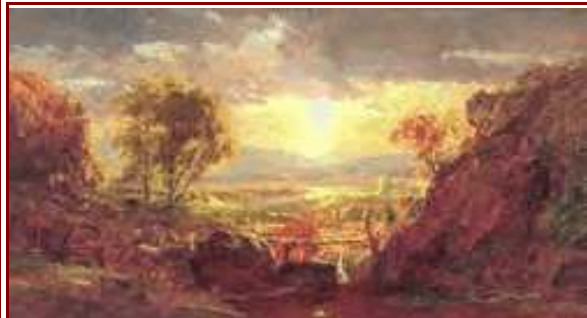
Jasper F. Cropsey (1823-1900)

The brisnet.com 'Race of the Day' is the $63,000 7th race allowance from Del Mar. For pps and a complete race analysis, click here .