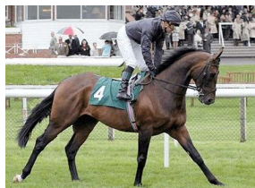
Hawk Wing

... (This block contains the continuation of the Hawk Wing article text from the previous block, which was truncated in the original image. The text describes his career, including his win in the G1 Aga Khan Studs National S., his performance in the G1 2000 Guineas, and his injury in the G1 Breeders' Cup Classic.)