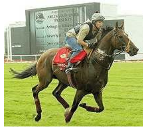
Kaieteur at Arlington