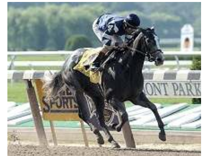
Spoken Fur