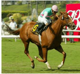
Tates Creek