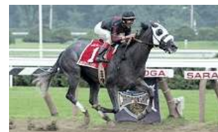
Island Fashion