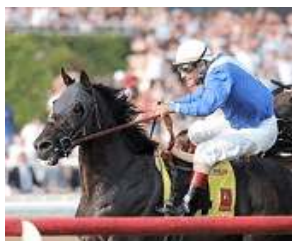
Storming Home