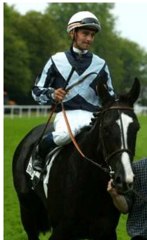
Six Perfections

Six Perfections (Fr) (Celtic Swing {GB}) finally got her moment in the sun as she led home a one-two for the finish Niarchos family, beating Domedriver (Ire) (Indian Ridge {Ire}) by a short neck in a thrilling renewal of the