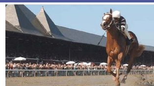
CUVÉE winning Saratoga Special-G2 by 7 1/2

Mr. Prospector – Blushing Promise , by Blushing Groom 2004 Stud Fee: $35,000 live foal