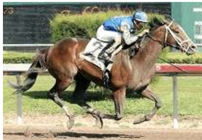
Harlan's Holiday