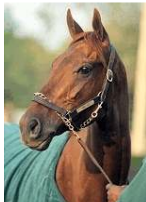
Funny Cide