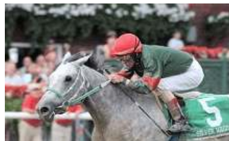
Silver Wagon

Before the GI Hopeful S., everyone had pegged Chapel Royal (Montbrook) as unbeatable. After the race, all eyes were on 12-1 longshot Silver Wagon (Wagon