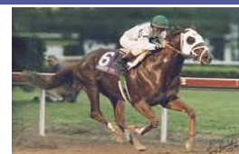
Cat Thief winning BC Classic (G1)

Storm Cat - Train Robbery, by Alydar 2004 Stud Fee: $35,000 live foal