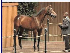
Hip 215