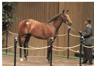
Hip 195