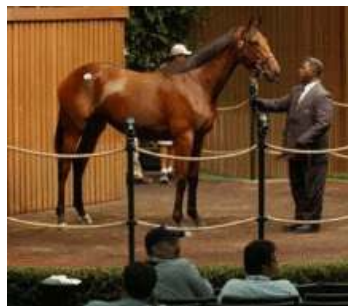
Hip 522

The sale's pavilion at Keeneland was already pretty hot before hip number 522 strode into the ring, but the daughter of Gone West caused the mercury to soar