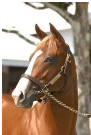
Hip 316