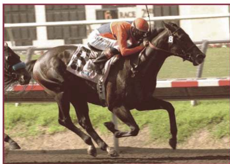
SIPHONIZER (shown winning first time out) took the Del Mar Futurity (G2). He's now pointing for the Breeders' Cup Juvenile (G1).

Click for the racingpost.co.uk race chart .