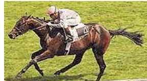
Diamond Green at Deauville