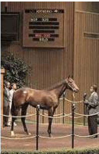
Hip 939