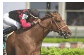
HONOR IN WAR

If you're looking for a great yearling in Keeneland September Book 4, give us a call.