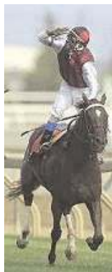
Wando