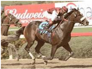
Tizdubai