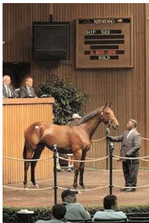
$3.8 million sale topper

The Keeneland September Sale concluded a wildly successful 12-day run yesterday, recording the second highest gross in the history of the event while posting new highs in average and median. Gross receipts rose by 30 percent, the average finished a whopping 28.5 percent ahead of the corresponding figure from 2002 while the median was up by a very solid 13.3 percent versus last year. The record gross of $291,827,100 was recorded back in 2000 when sales were reported on 3,313 head, nearly 350 more than this year. With the exception of yesterday's finale, each session was up versus the corresponding session in 2002. "Everybody here at Keeneland is very happy," commented Director of Sales Geoffrey Russell. "Going in, we would have been happy with level or a little bit of an increase from last year, but to have the sale 30 percent up is fantastic