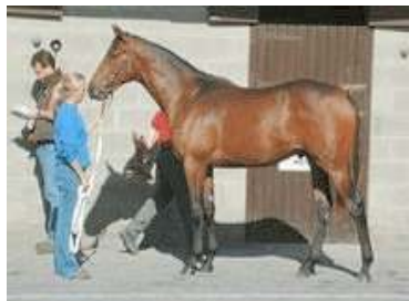
Hip 149