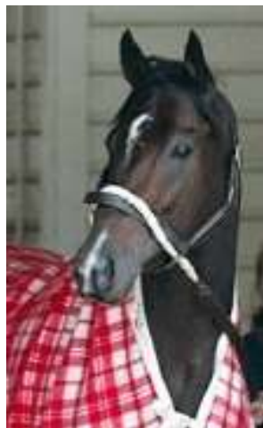
Sky Mesa