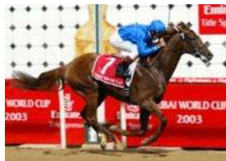
Moon Ballad winning the World Cup