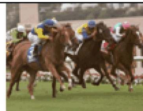
MEGAHERTZ - 7 WINS & $1.1M