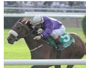
Dimitrova