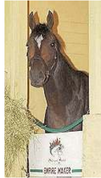
Empire Maker

Juddmonte Farms has announced that top three-year-old Empire Maker (Unbridled--Toussaud, by El Gran Senor) has been retired and will enter stud in 2004 for a fee of $100,000, live foal. The colt, who had not raced since finishing second in the GI Jim Dandy S. Aug. 3, was forced to miss the GI Jockey Club Gold Cup Sept. 27 when he suffered a bruised foot in the days leading up to the race. "Empire Maker is the best horse I have ever trained," said Hall of Fame conditioner Bobby Frankel, for whom the colt won three Grade I races this year. "We weren't within 10 lengths of seeing this horse's best race." A son of Unbridled, who died in 2001, Empire Maker is the fourth Grade I winner produced by Broodmare of the Year Toussaud. Cont. p2