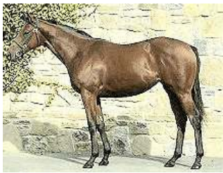
Lot 114, Dubai Millennium filly