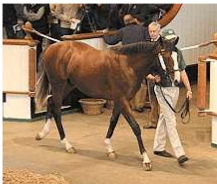
Session-topping Kingmambo colt tattersalls.com

Session records for the Tattersalls Houghton Sales at Newmarket, England, were set last night, with the average and median reaching heights never seen before. The initial evening session produced an average of 269,566 guineas and a median of 230,000 guineas, up by 17 percent and 53 percent, respectively, on last year's first session. The initial excitement at Europe's premier yearling auction, the Houghton Sales, was generated, as expected, by lot 5 , a colt by Kingmambo