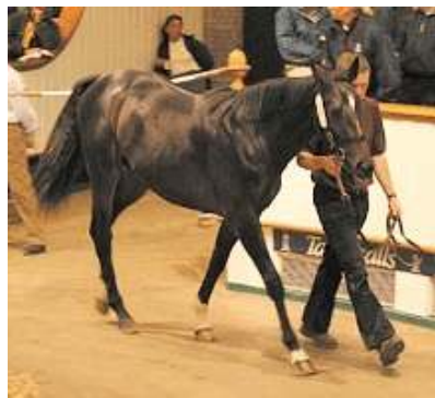
Lot 33, King's Best (Ire) colt