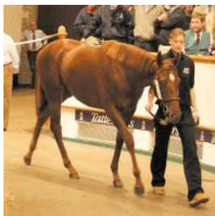
Lot 115 Tattersalls