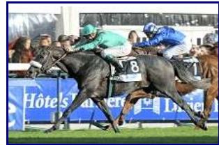
Dalakhani

Settled towards the rear by Christophe Soumillon throughout the early stages, 6-4 Dalakhani (Ire) was