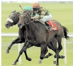
Alamshar defeating Dalakhani