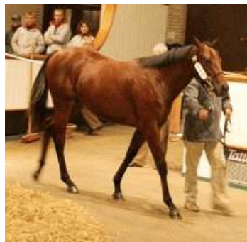
Lot 238 Tattersalls