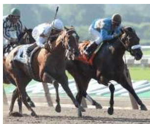
Bird Town