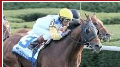
PERFECT SOUL wins Shadwell Turf Mile-G1