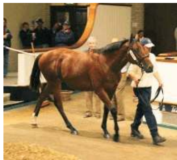
Lot 511