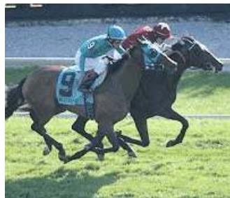
Film Maker (foreground) nips Maiden Tower

The winner of the GIII Lake George S. at Saratoga July 28 and third in the Aug. 17 GII Lake Placid H. at the Spa, Film Maker (Dynaformer) proved equal to the task of Grade I company yesterday, surging to the front in the final lunge to best European invader Maiden