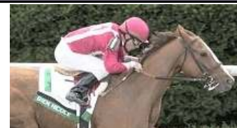
BIEN NICOLE wins WinStar Galaxy-G2