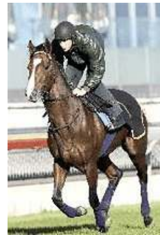
Phoenix Reach

Brian Boru (GB) (Sadler's Wells) makes his first foray across the Atlantic as the morning-line favorite in the G1 Canadian International today at Woodbine. The bay colt's biggest moments to date have come at Doncaster in England, where he captured the G1 Racing Post Trophy last year and followed up that conquest with the G1 St. Leger S. trophy Sept. 13. His connections, successful last year with Ballingarry (Ire) (Sadler's