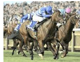
Milk It Mick (blue) defeats Three Valleys (pink)