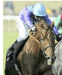
Persian Punch

Making his 12th start of the year, 33-1 Milk It Mick (GB) (Millkom {GB}) denied 11-4 favourite Three Valleys (Diesis {GB}) to take the G1 Darley Dewhurst S. on a day filled with upsets at Newmarket yesterday afternoon... p3