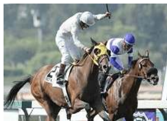
Got Koko besting Elloluv in the Lady's Secret

Distaff hopefuls Got Koko (Signal Tap) and Elloluv (Gilded Time) worked yesterday at Santa Anita. The