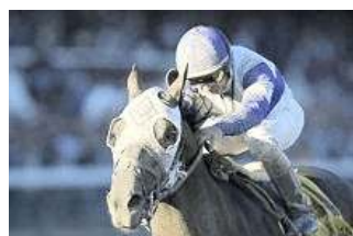
Ten Most Wanted A Coglianese

important than good post position." The morning-line oddsmaker was not deterred by the draw, making Cuvee 8-5 and Halfbridled 7-5. But she is not the shortest-priced morning-line favorite on Breeders' Cup Day. That honor goes to Sightseek (Distant View), who, after the defection of defending champ Azeri, is 6-5 to take the Distaff. On paper, the Classic appears to be a much closer contest, with four-year-old Medaglia d'Oro (El Prado {Ire}), at 3-1, edging the gelding Perfect Drift (Dynaformer), 7-2, for the role of favorite. Medaglia d'Oro, who broke from the seven hole last year, got post 8 this time. "I won't have any excuses because of the post position," trainer Bobby Frankel said. Frankel will saddle eight runners on the Breeders' Cup card, including Sightseek and Sprint favorite Aldebaran (Mr. Prospector). "All I can say is that they are all coming into their races exactly, exactly the way I want,"