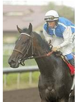
Halfbridled Benoit Photo

The favorites for the GI Breeders' Cup Juvenile, Cuvee (Carson City), and GI Breeders' Cup Juvenile Fillies,