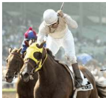
Got Koko