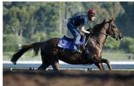
Hold That Tiger at Santa Anita