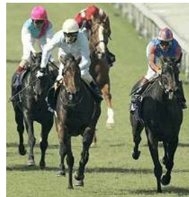
Islington (left) beats L'Ancrese

It's beginning to look like a trend. Since the inaugural running, three of the four winners of the GI Breeders' Cup F/M Turf had competed in the race the previous year. Perfect