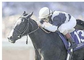
Six Perfections