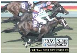
Dead-heat in the Turf