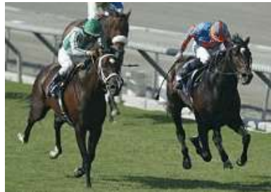
Johar (left) and High Chaparral duel to the finish

It took 20 years and a total of 144 individual Breeders' Cup races, but yesterday's John Deere Turf produced the first dead-heat in the history of the event when defending Turf champion High Chaparral (Ire) (Sadler's Wells) and Johar (Gone West) found the wire