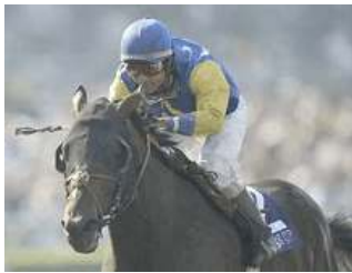
Pleasantly Perfect

Pleasantly Perfect had started just three times since his 2002 Goodwood victory, running third behind Congaree (Arazi) in the Feb. 2 GII San Antonio H. and fourth to Milwaukee Brew in the Mar. 1 GI Santa Anita H. Sidelined by a series of minor problems, including a foot injury in the spring, he was sent off the 7-5 choice in this year's Goodwood and closed from the back of the pack for the score. An outsider in the Classic, he was eased off the pace as Congaree and the 5-2