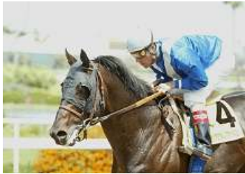
Storming Home

After suffering a badly cut hoof in the early stages of Saturday's GI Breeders' Cup Turf, Sheikh Maktoum's Storming Home (GB) (Machiavellian--Try To Catch Me, by Shareef Dancer) has been retired and, as previously reported, will stand at England's Shadwell Stud for the 2004 season. The five-year-old will begin his stud career at a fee of £10,000, special live foal. The bay had a break-out year in 2003 after coming state-side, recording victories in the GI Charles Whittingham Memorial H., GI Clement L.