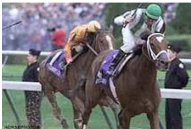
Spain winning the 2000 Breeders' Cup Distaff