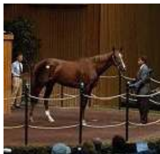
Hip 766

Five-year-old Red N' Gold (Tabasco Cat--Pasampsi, by Crow {Fr}) starred yesterday during the Keeneland November Sale, eliciting a bid of $425,000 from WinStar Farm to top the third session. "She was one of