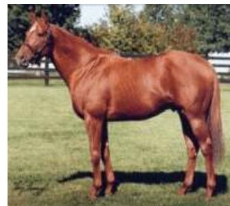
Golden Missile adenastallions.com

The covering sires include El Prado (Ire), Golden Missile, Red Bullet, Running Stag, Touch Gold and Wild Rush. Included in the purchase price of each mare is a 2004 no-guarantee season to the Adena Springs stallion specified on each catalogue page.