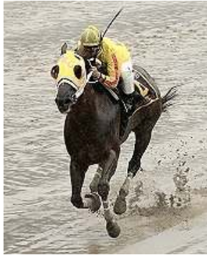
Shake You Down

Shake You Down (Montbrook), a game third in the Breeders' Cup Sprint, heads a field of 10 sprinters in today's GI Frank DeFrancis Memorial Dash at Laurel Park. In the Sprint, Shake You Down broke slowly, rushed up to press a torrid pace and held on for third.