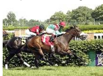
Ipi Tombe winning the Locust Grove

South African champion Ipi Tombe (Zim) (Manshood {GB}--Carnet de Danse, by Dance In Time), winner of the G1 Dubai Duty Free S. this past March, has been retired after a training setback which would have prevented her from defending her title in the $2-million event in March. Owned by a partnership including WinStar Farm, Team Valor and Sunmark Partners, the five-year-old won eight of her first 10 career starts in