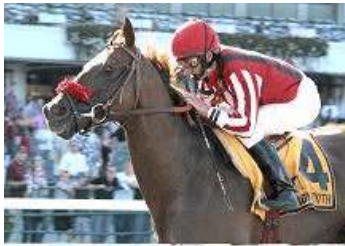
Tenpins winning the Iselin

They'll come from far and wide for Friday's Gill Clark H. beneath Churchill Downs' Twin Spires, which has seen its purse increased by $100,000 for this year's renewal. In a race which figures to offer a veritable