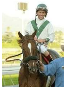
Congaree Benoit Photo