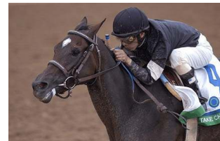
Take Charge Lady