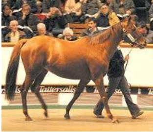
Lot 1898 - Ramruma Tattersalls.com

Ramruma (Diesis {GB}), winner of the G1 Epsom Oaks, G1 Irish Oaks and G1 Yorkshire Oaks in 1999, became the most expensive broodmare sold in a European auction ring yesterday afternoon when bought for 2.1 million guineas (approximately $3.9 million) by