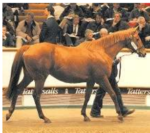
Lot 1897 - Midnight Line Tattersalls.com