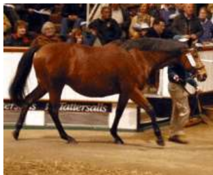
Lot 2206 - Lady Carla Tattersalls.com