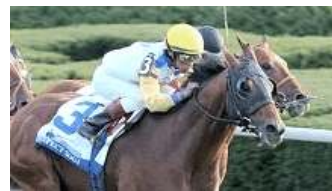
Perfect Soul