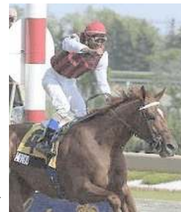
Wando