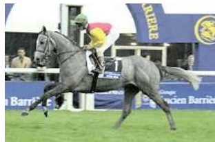
Fair Mix

Overseas challengers for Sunday's Hong Kong International Races were out in force at Sha Tin for the first time yesterday. The French team, numbering six, all did light exercise on the all-weather circuit. Cup contenders Bright Sky (Ire) (Wolfhound) and Tigertail (Fr) (Priolo) were followed by Fair Mix (Ire) (Linamix {Fr}), Polish Summer (GB) (Polish Precedent), Vallee