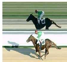
Daryamar